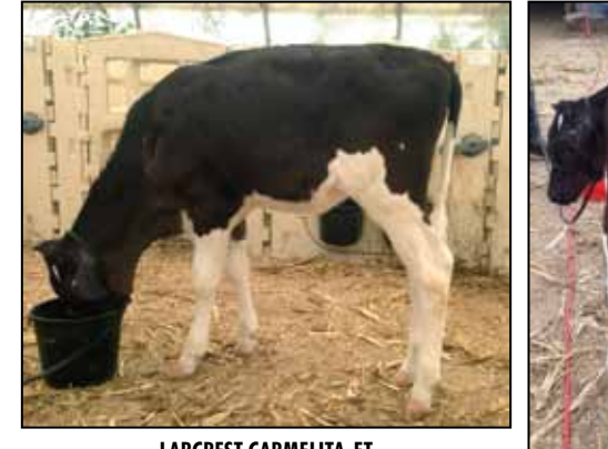
LARCREST CARMELITA-ET SELLS AS LOT 16