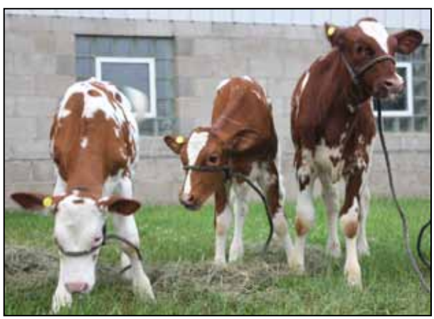
L TO R: C - SCIENTIFIC HILLY RAE-RED-ET, B - SCIENTIFIC D MORGAN RAE-RED A - SCIENTIFIC MO DARLI RAE-RED