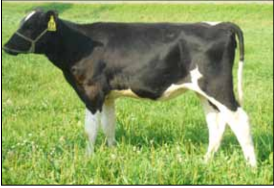
LEXVOLD TANGO LOVE-ET SELLS AS LOT 9