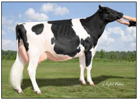
MS ROLLNVIEW GOLD DIVINE-ET VG-88 SELLS AS LOT 23

LOT 25 - GTPI PTA + 166 combined Fat and Protein.