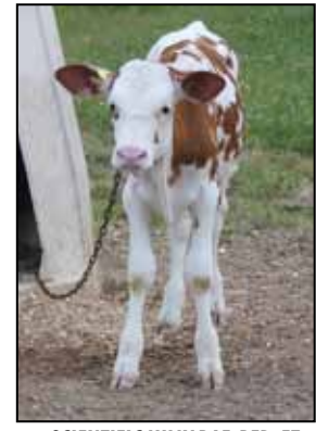
SCIENTIFIC HILLY RAE-RED-ET LOT 42C