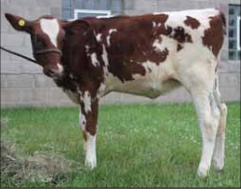
SCIENTIFIC MO DARLI RAE-RED LOT 42A