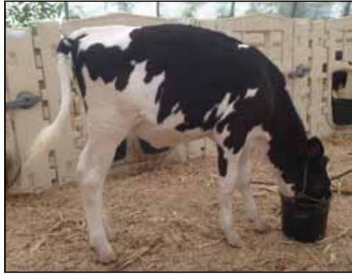
LARCREST CORONATION-ET SELLS AS LOT 17

LOT 17 - This is a very nice calf that definitely resembles her dam. She is straight topped, open ribbed and dairy. Her feet and lets are correct, and she has some style. Not too often that you have a chance to bid on calves that are this high for TPI and Net Merit that have a maximum score dam and grandam! This calf is already +832NM and +2371 GTPI, but at +63P she will like the upcoming changes to those indices too!