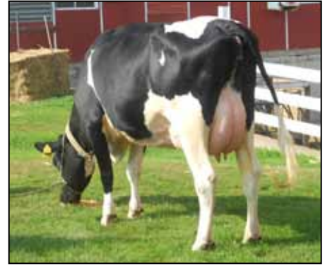
T-SPRUCE ARMITAGE 4678-ET GP-83 DAM OF LOT 9