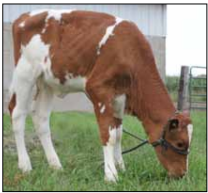
SCIENTIFIC D MORGAN RAE-RED LOT 42B